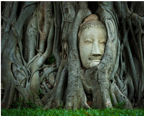
Buddhism and Freemasonry: A Certain Perspective