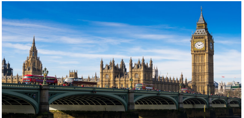
Why and how was freemasonry born in England?